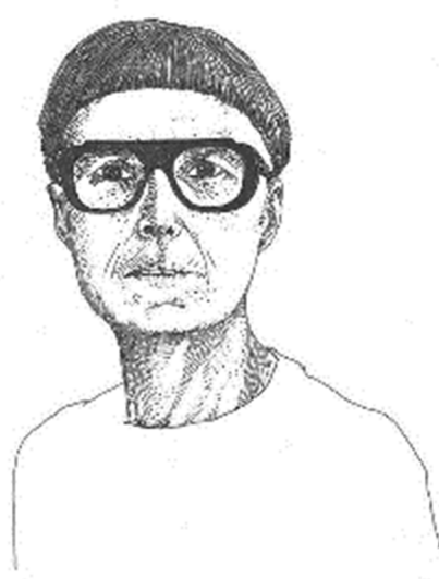
MATALI CRASSET - Translator -