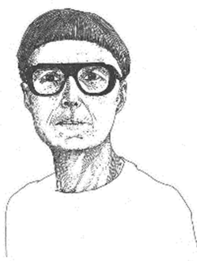
MATALI CRASSET - Translator -