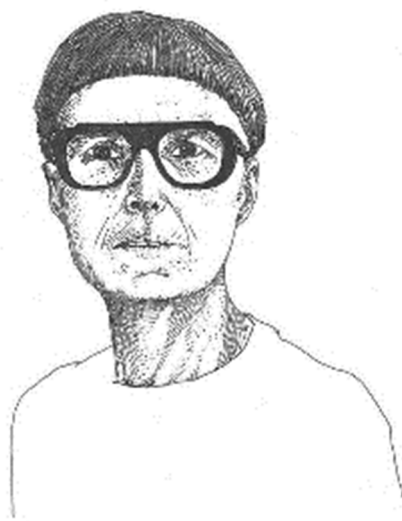
MATALI CRASSET - Translator -