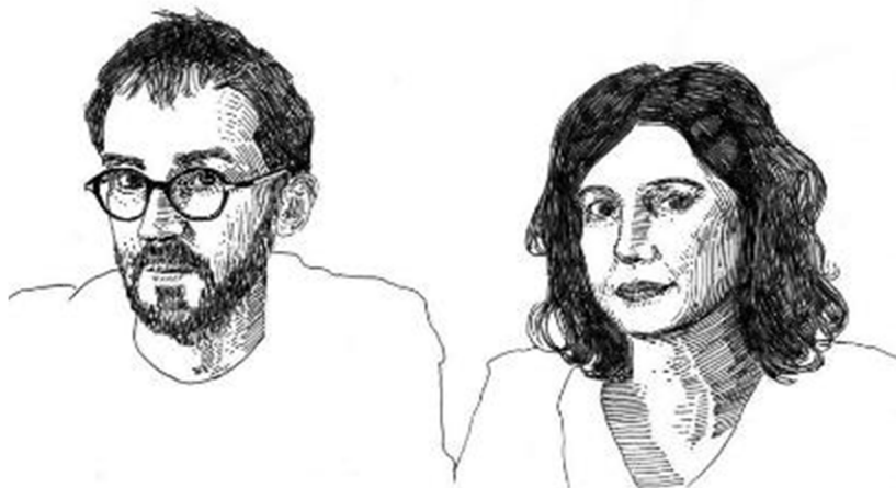
STUDIO FOLDER - Translator -