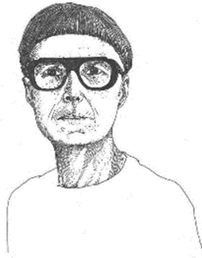
MATALI CRASSET - Translator -